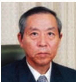
Toyohiro NOMURA President Software Information Center

From its activities and achievements SOFTIC has come to be recognized domestically and abroad as a center for basic information on software. SOFTIC intends to continue to stay active in building the IT society, which eagerly awaits developments such as electronic commerce, and we appreciate your continued support and cooperation in these endeavors.